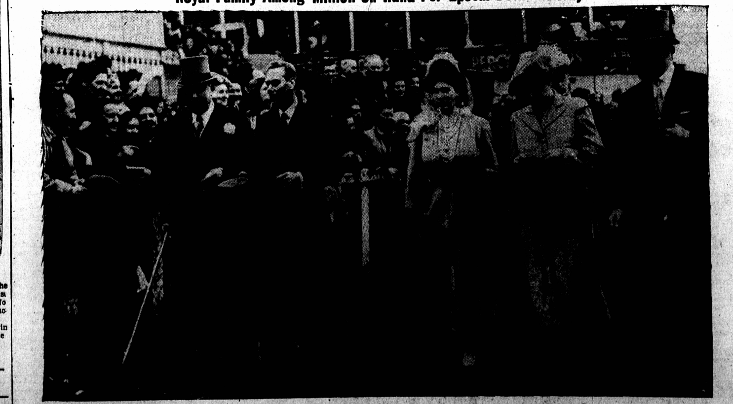
The royal family was among racegoers from all Britain who flocked to Epsom Downs to witness the year's "blue riband" racing event, the Derby. Walking down the lawns in this photo are Lord Roseberry at left, the King, Princess Elizabeth, R.H.R., Princess Royal and the Duke of Norfolk. The Duke of Edinburgh, husband of Elizabeth, can be seen behind the Princess Royal. An estimated 1,000,000 fans saw the Derby.