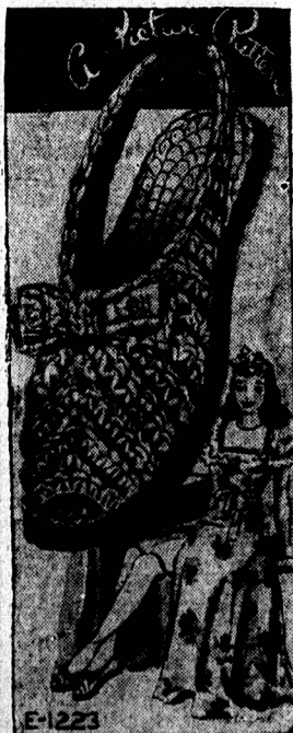
DESIGN NO. E-1223

Get the scrap bag out, cut the scraps in strips and crochet these slippers in a jiffy. Pattern No. E-1223 contains complete instructions. Needlework Book 20 cents. To order: Send 20 cents in coin to Needlework Bureau, Charlotte, N.C. Send to Needlework Bureau, Charlotte, N.C. Design No. E-1223