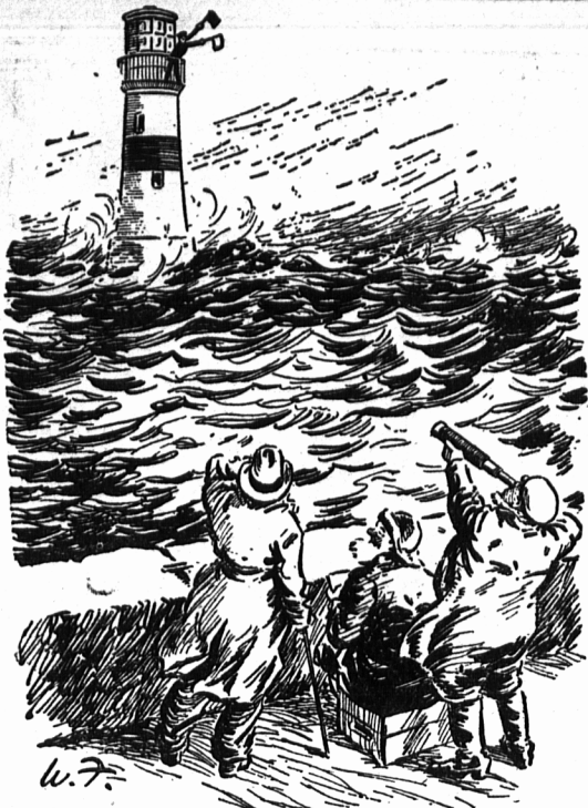
"When it's stormy we fill in 'is football coupon for 'hm'!" —Humorist.