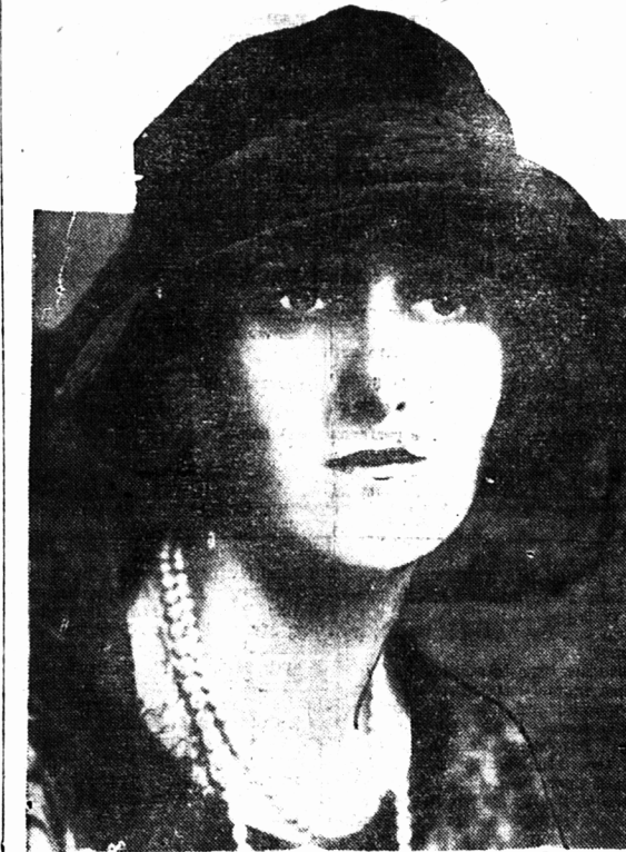
Whether Lady Cynthia Mosley and her husband, Sir Oswald Mosley Labor M.P. for Smethwick, England, will accept the baronetcy made vacant by the death of Sir Oswald Mosley is a matter of conjecture. Both scoff at titles. Lady Cynthia is the second daughter of the late Marquis Curzon.