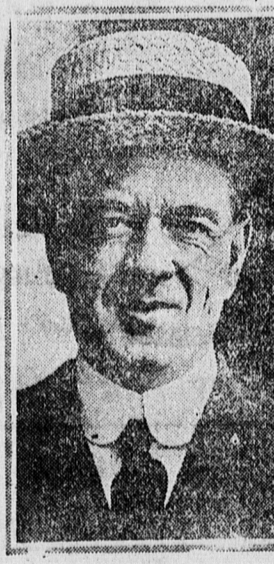
Frank H. Hitchcock