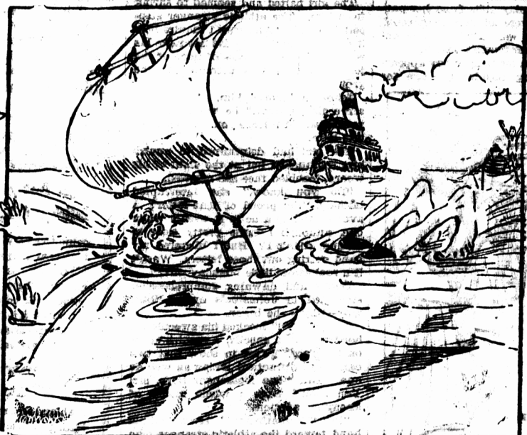
The Minister was blown along so fast we couldn't catch him.