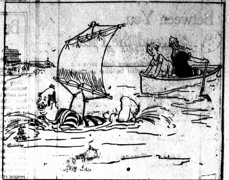
Papa got along so nicely that the Minister wanted to try it.