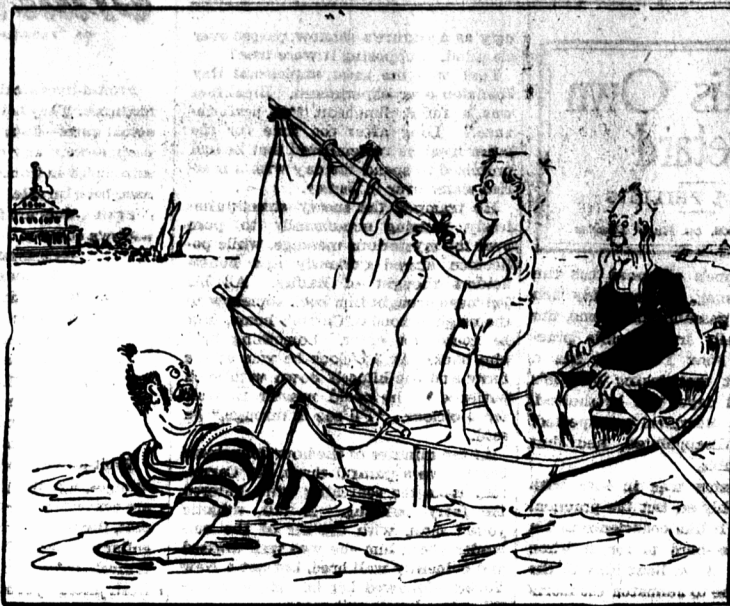
Papa, the Minister and I went out into the bay to try it.