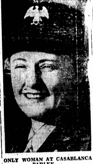
ONLY WOMAN AT CASABLANCA