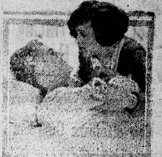
J. STUART BLACKTON "MISSING" Paramount Pictures

A Love that passeth all understanding kept green the memory of the man recorded "Missing"