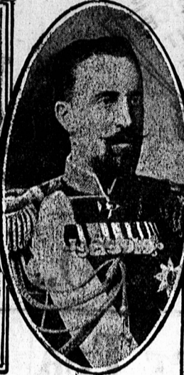
GRAND DUKE NICHOLAS