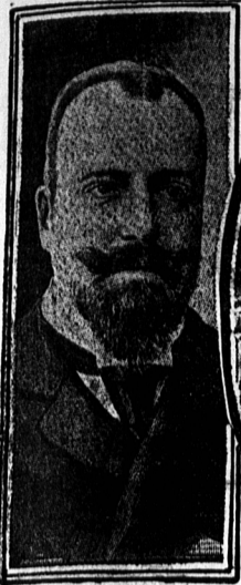
GRAND DUKE ALEXANDER