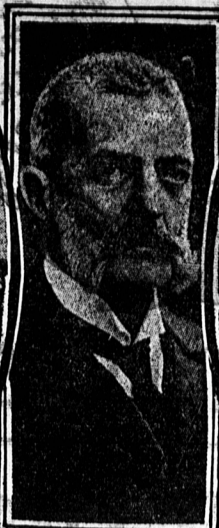
GRAND DUKE VLADIMIR