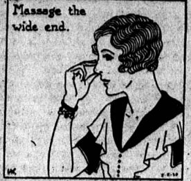
REMODELING THE NOSE

Are you satisfied with the shape of your nose? If you are, you have great cause for thankfulness. Judging from the dozens of letters from readers who want something done about the size or shape of their noses it seems that few are pleased with this feature. "My complexion is lovely," writes one young lady, "and several times I have overheard acquaintances remark that I am good-looking, but some one who hears it will be sure to say, 'She would be if it wasn't for her nose.'"