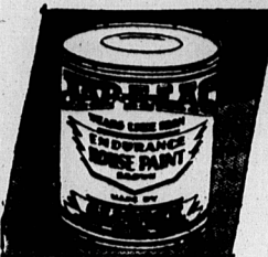
WEARS LIKE IRON

Try out for yourself the superiority of the new Jap-a-lac Paint. By rubbing between finger and thumb, get the smooth feel of it; that is the proof of fine grinding of the base materials.