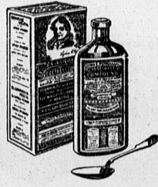
Remember this package. None genuine without the signature of Lydia E. Pinkham.