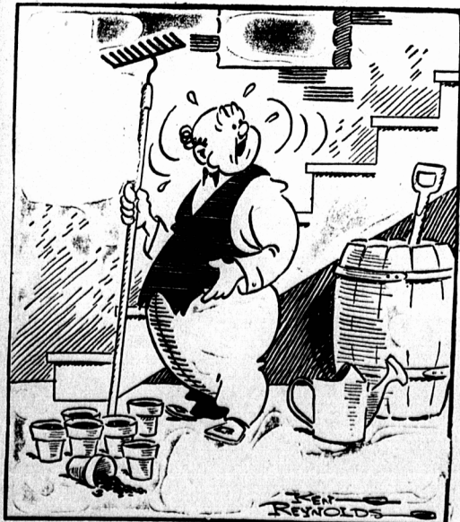
"Have we eaten all of those tulip bulbs I got with that Guard-las Wand Ad?"