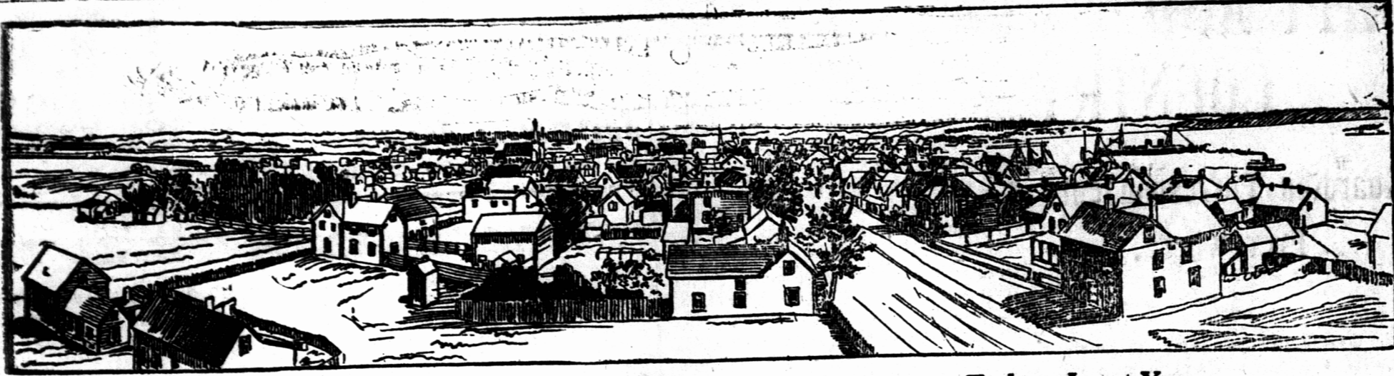
The Town of Sydney, Looking South From a Picture Taken Last Year.