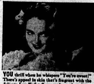
YOU thrill when he whispers "You're sweet!" There's appeal in skin that's fragrant with the delicate Lux Toilet Soap perfume that clings.

"THERE'S THRILL in skin that's fragrantly smooth and soft," says lovely Barbara Stanwyck. "You'll love the delicate, clinging perfume of Lux Soap beauty bath leaves on your skin. It's foolish to take chances—daintiness is the most important charm of all. Lux Soap's Active lather makes you sure—swiftly carries away dust and dirt, leaves skin fresh and sweet." You'll love the luxury of using this fine white beauty soap as a daily bath soap, too. You'll agree—Lux Girls are daintier!