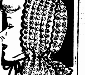
DESIGN NO. E-917

To order: Send 20 cents in coin to Needlework Bureau, Charlottetown Guardian, Design No. E-917