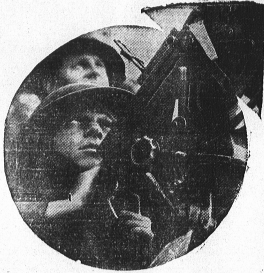
Your Quarters will keep 'em Poppin'

FRIDAY EVENING, JULY 24th. at 7 o'clock --- in co-operation with the Merchants of Ch'town.