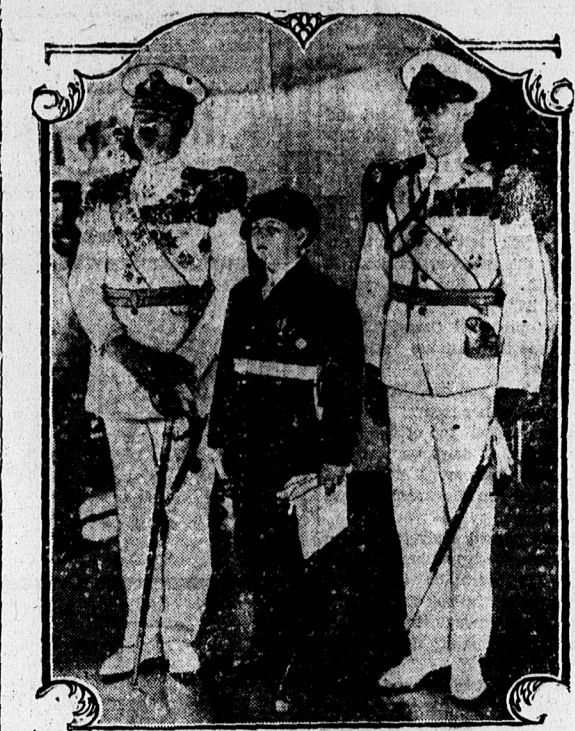
KING AND EX-KING REVIEW THE TROOPS

Young Michael used to have the cant, together with his uncle Nicholas, whose speeding motor car is among the new perils of the Balkans. The military review took place at Constantia, with huge crowds an "also present" at the big party.