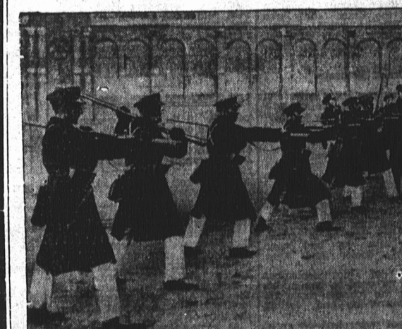
Pacific Holland, unlike other European nations, does not encourage the photographing of imposing arrays of its military forces. This picture shows a mere detachment of Dutch infantrymen during maneuvers.

By NEA Service THE HAGUE, March — The Dutch, one of the sturdiest, spunkiest peoples in Europe, see a good deal of attention to Dutch affairs. They have charged that Holland has placed 16 of its frontier defense battalions on the West front, facing Germany, only seven on the South, facing Belgium and only one on the coast facing over toward England.