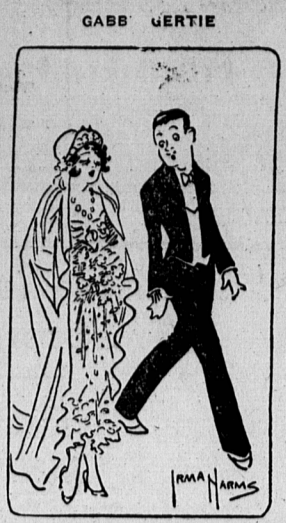
"Even a shoe clerk may marry an heiress if he gives her the right smiles."