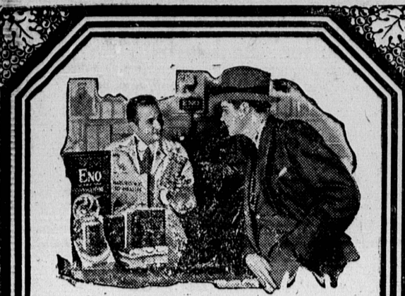
A train to catch—his Eno left behind.