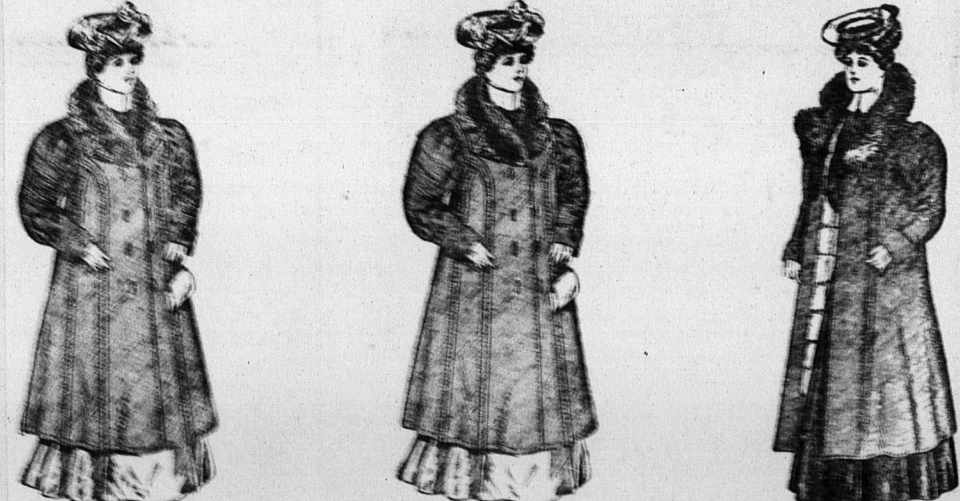
Handsome fur lined coats, $44.50 to $50.00. SPECIAL SHOW