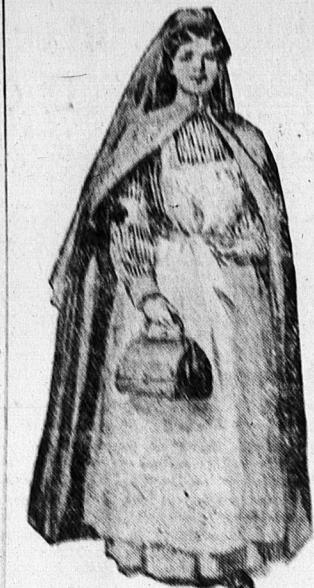
TRAINED NURSES PERSONALLY RECOMMEND GARDNER'S CURE FOR ALL SUFFERERS

Bad Breath, K' Hawking and Spitting Quickly Cured - Fill Out Free Coupon Below.