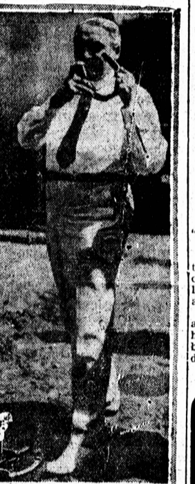
Senator Warren G. Harding has not forgotten how to pitch horseshoes in his younger days; he was the local champion. The Republican nominee for President is shown here pitching horseshoes at his home at Marion, Ohio, with members of a visiting delegation as opponents.

such as gave much amusement to our citizens and visitors on the Market Square. We are pleased that our City authorities paid no attention to the appeal to have the shows prohibited on the square, as during Exhibition week we must have a little fun, even if in the end we know we will probably lose a few cents.