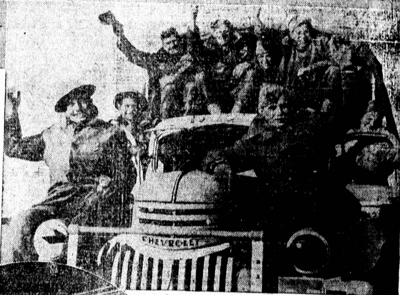
This lorry load of men travelled for three days and nights, through enemy territory of times, to get back to the British lines after being close to capture.

This is a spot where your General Motors Transports are getting their severest test of the war. Trucks and more trucks are needed. We hope you're busy making them.