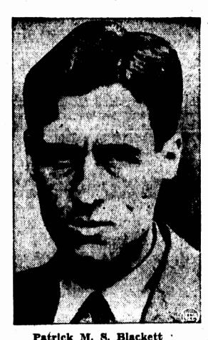
Patrick M. S. Blackett