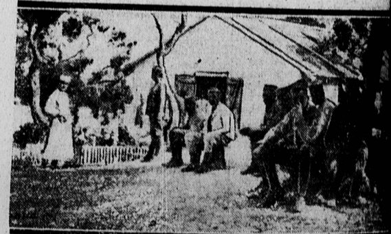
A party of Greek soldiers taking it easy on the Island of Corfu, which is one of the bones of contention in the present Greco-Italian squabble.