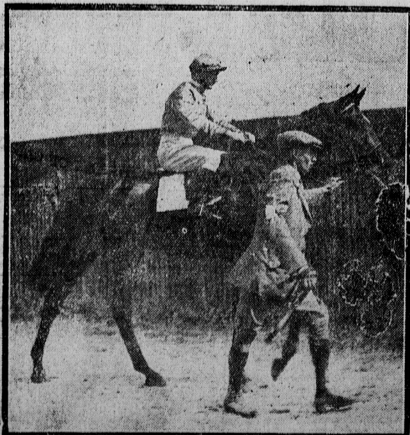
Fleet footed Zev is expected to be Papyrus' opponent in the pending race between the Derby winner and an American horse at Belmont Park, U.S.A., on October 20. The winner will take £40,000.