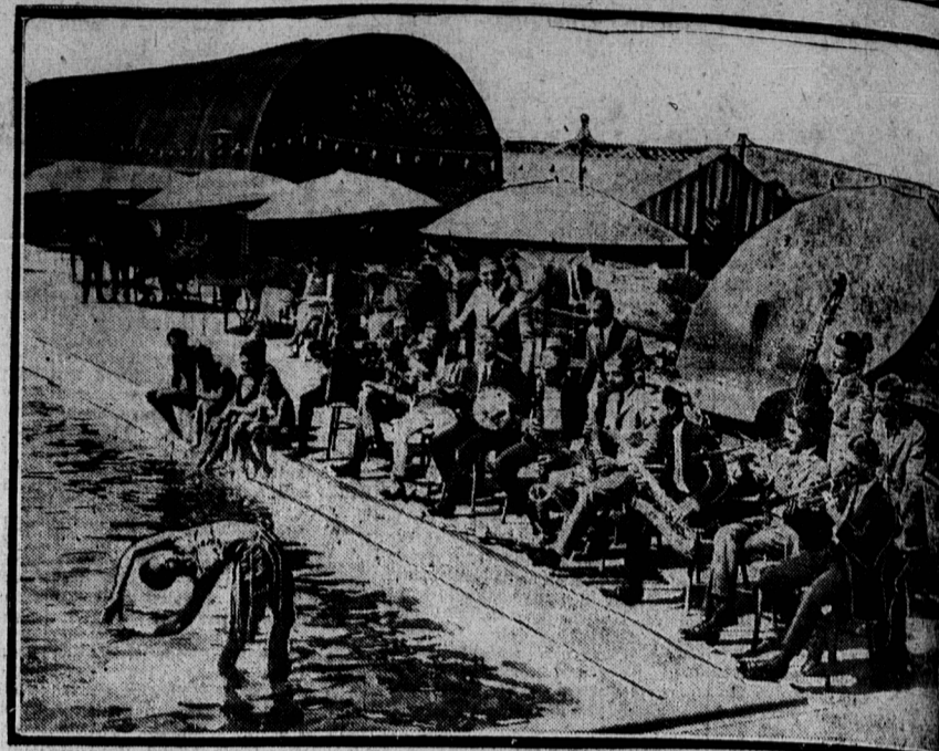
A false step by Miss Verona Lee means a ducking in four feet of cold water, for she is doing this "dance on the water" on a three-foot table just beneath the surface of the pool.