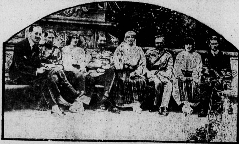
When royalty goes a-calling, in the centre are King Ferdinand and Queen Marie of Rumania. On the King's left are his children, Princess Elizabeth and Prince Nicolai, and an attache of the Polish embassy. On the Queen's right are Marshall Pilsudski, Crown Prince Carrol and Princess Eleano, his wife, of Poland.