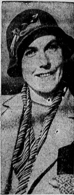
"DOUBLES" FOR FATHER