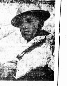
4—"TRIGGER MAN" waits, poised, to discharge gun as crew set in instruments ordered by predictor, putting planes directly "on the spot."