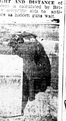
3—PREDICTOR MACHINES synchronize data electrically flashed from scattered sighting units, automatically issuing gun orders.