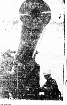
2—HEIGHT AND DISTANCE of enemy aircraft is calculated by British new scientific aids to anti-air defence as hidden guns wait.