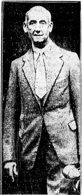
Next lord mayor—Sir George Broadbridge, who according to reports, will be London's lord mayor for the coming year, and will take a prominent part.