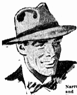
Narrow band and binding. Rayon lined

Three Band and Brim Widths to Choose From... In Regular and Oval Shapes... Many Styles!