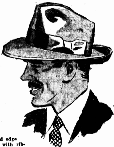
Bound edge brim with ribbon binding.

Three Band and Brim Widths to Choose From... In Regular and Oval Shapes... Many Styles!