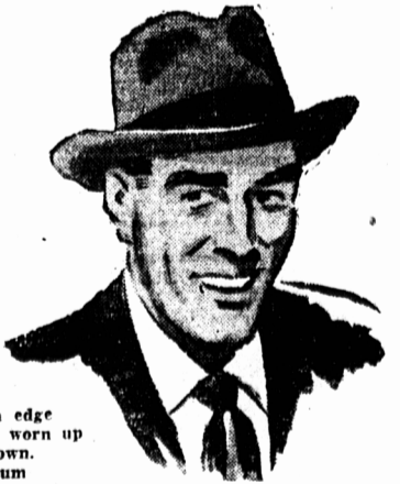
Plain edge brim worn up or down. Medium band.

Good wool felts blended into smooth-textured, pliable bodies... in many interesting styles, becoming to all men! Pick yours for its rich tone that blends with whatever you wear, its easy lines. For that's how it'll stay every time you wear it! No patting or coaxing into shape... for experts have put the shape in to stay!