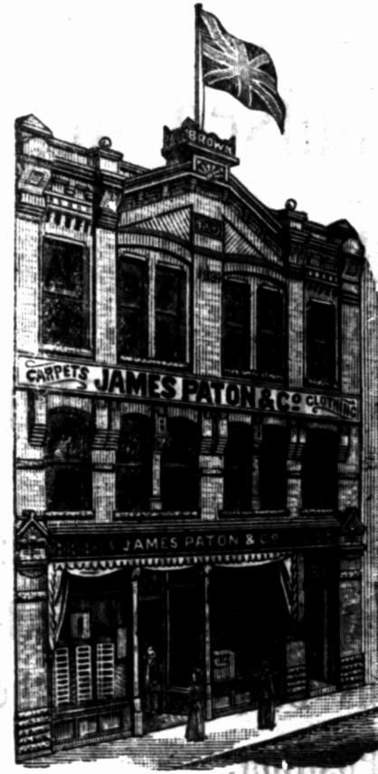
Where the Bazaar is Being Held.

The apron booth combined with ladies' silk waists, ties, undergar, handker-