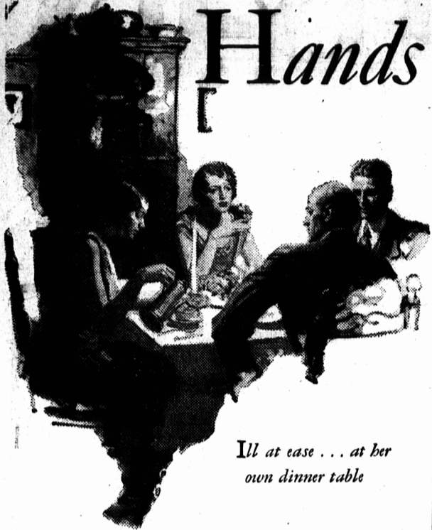
Ill at ease... at her own dinner table