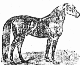
ACHILLE. Race record—2:15 1/4.