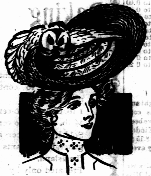
SCARLET STRAW HAT.

A very smart gown seen recently was of hand painted muslin, and from the knees to the feet there was a border consisting of trellis work of woven green ribbons and pink roses. This was much befouled underneath to give the necessary flare. The trellis work also appeared on either side of the bolero bodice, which was cut short at the back over a green spotted muslin blouse finished with a draped waistband of taffeta. The costume was completed by a hat composed entirely of green leaves over a foundation of tucked pink chiffon finished with two black velvet strings and a black rose resting on the hair while another rose held the strings in place on the bodice. With