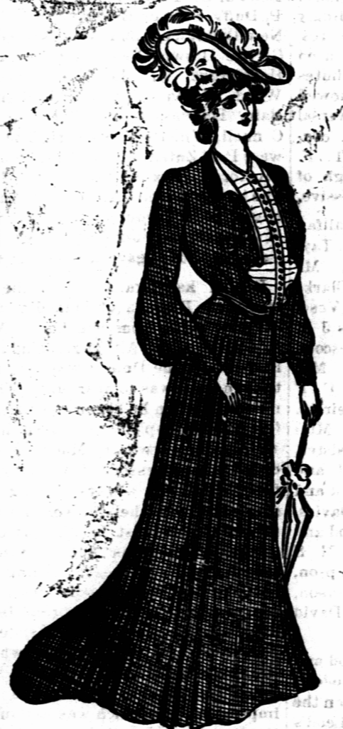
CHECKED TAILOR MADE.

Tussore silk and tussore linen are the most useful fabrics for dust cloaks, but alpaca, when dressed in the soft, limp style, is also admirable, and the colorings most in vogue are the beige