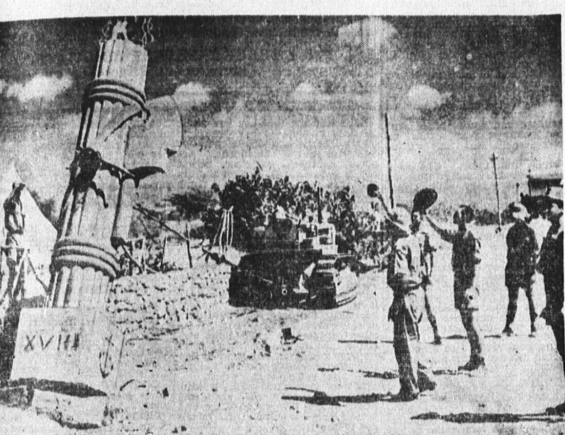
British troops, having rounded up all but a few straggling remnants of the Italian forces in eastern Syria, take time off to destroy signposts of Roman imperialism passed by during their rapid conquest. At Chisnago, in Italian Somaliland, South Africans cheer as the Fascist symbol of a Duce topples into the dust after a little persuasion by a trace.

Cheers Go Up As Duce's Emblem Comes Down