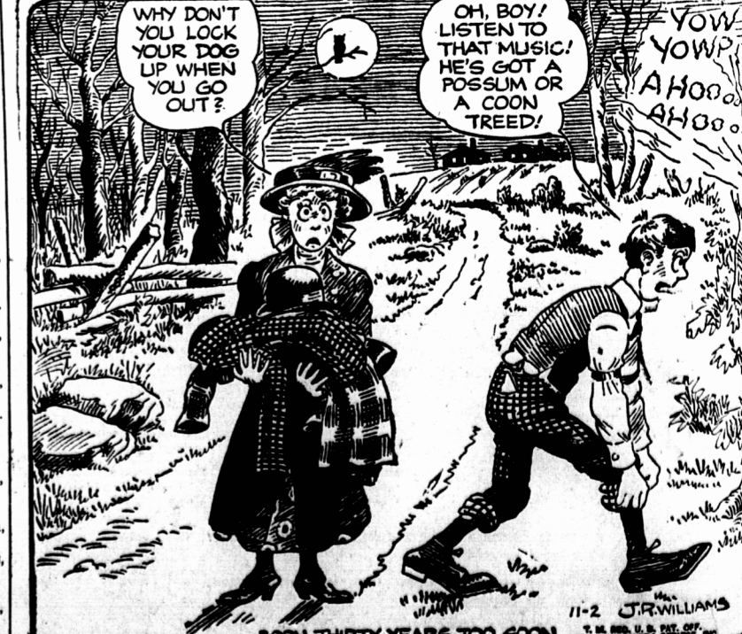
BORN THIRTY YEARS TOO SOON