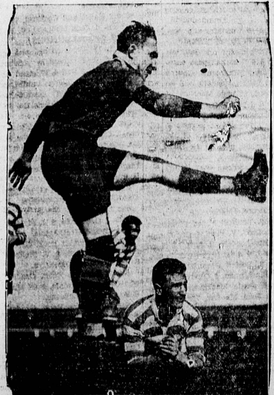
GETS READY FOR INTERNATIONAL TESTS