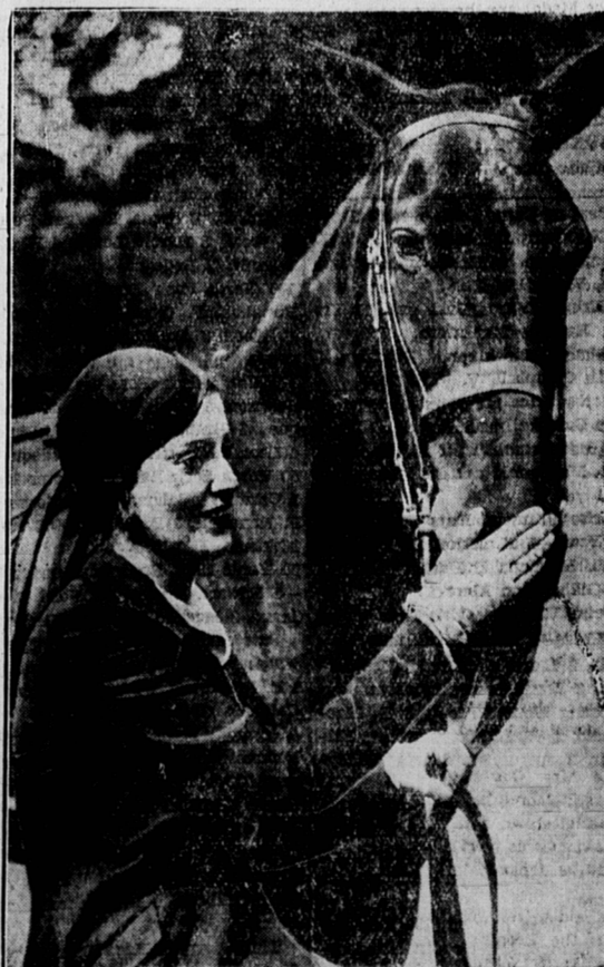
THIS FELLOW SEEMS TO BE FRIENDLY