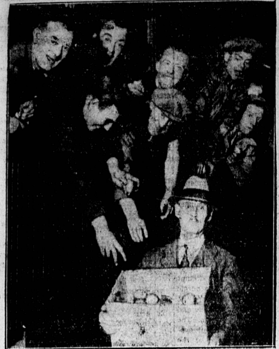
TROUBLES ARE OVER FOR THE WINTER

This game really ought to be played to music. Look at these ladies rising to the occasion during recent Arsenal-Everton clash at Highbury, England.