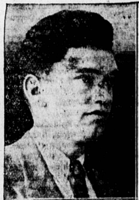
INDICTED AS BABY KILLER

Not scenes of labor in Communist Russia, but brickmakers in England, in the village of Amblesote, to several others. Stourbridge. Women villagers constitute main body of employees in local fire brick works and have reputation for producing finest hand-made fire bricks in the world.