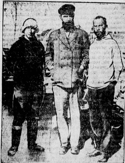
SPEND HAZARDOUS MONTHS IN NORTH

Vincent Coll, young gang chief, who was indicted before a New York court as one of the members of gang responsible for shooting in Harlem recently which resulted in the death of one child and injury to several others.