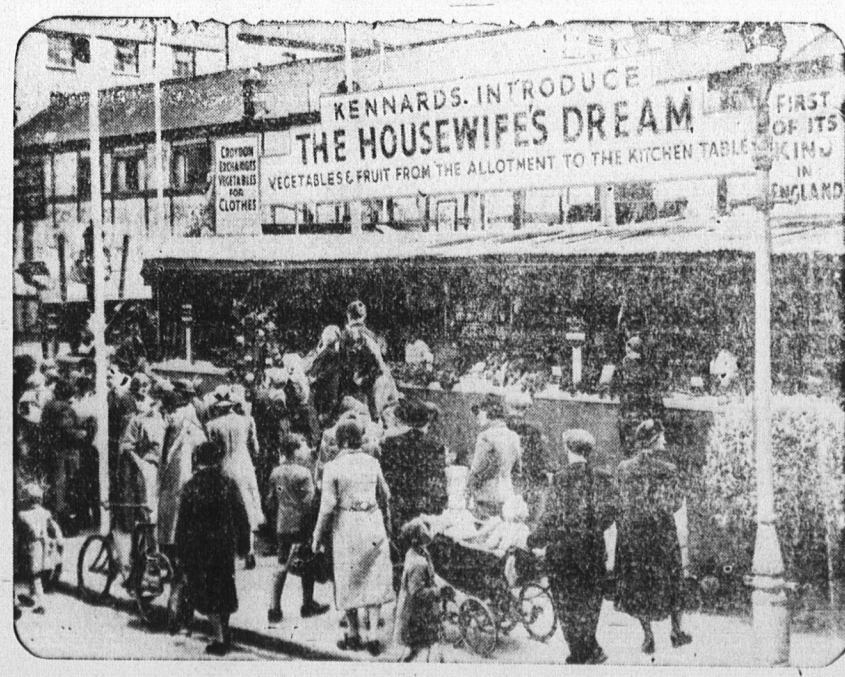
Shoppers flock around the new barter market set up in South Croydon by Sir Herbert Williams, M.P. for the district. The age-old system of barter enables local growers who have grown more than they need for their own consumption to exchange the surplus for clothes, vegetables, footwear, blankets, furniture and other goods without giving up precious ration coupons.