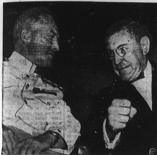
Pleading for support of the President, Rear Admiral Richard E. Byrd, on leave from the Navy, asked a national emergency rally of 15,000 people in Madison Square Garden, New York, for a spontaneous reawakening of all people, determined on dynamic unity, sweat and sacrifice to fight Nazism. Supreme Court Justice Owen Roberts, pictured above, right, with Byrd at the rally, proposed a "world union" for permanent peace after the war.