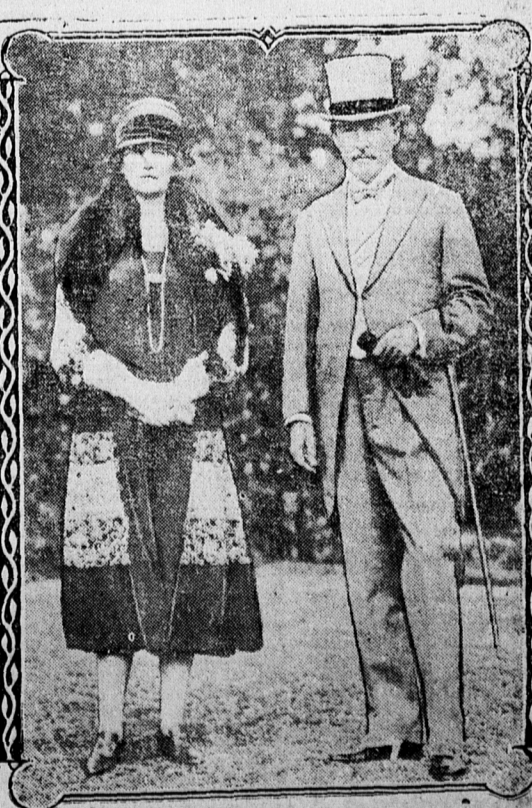
His five-year term as governor general of Bermuda, expiring in April of 1927, Sir J. J. Asser, with Lady Asser, will return to England. This photo, taken recently at a garden party at the Government House at Bermuda, shows Governor-General J. J. Asser and Lady Asser.