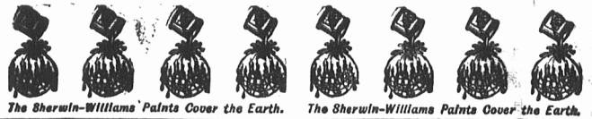
The Sherwin-Williams Paints Cover the Earth. The Sherwin-Williams Paints Cover the Earth.

"What a lovely rose! Did your mamma give it to me?" "Yes'm, but she don't know it."—San Francisco Examiner. How He Looked at It. Cholly was having some trouble with a horse that was ordinarily gentle. "By gum!" exclaimed the doctor. "That horse is most human. I bet he got a look at you an' has a sense of shame over the situation he finds himself in."—Chicago Post.