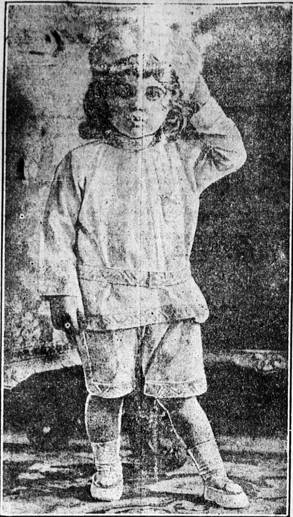
This snapshot of the Czarich of Russia, only son of the Czar and Czarina and heir to the throne of Russia, was taken aboard the Imperial yacht Standart by the mother of the little Prince.

Phone 199 Phone 199 Cor. Kent and Great George St. 3-111111