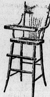
$1.75, $2.00, $2.50

Toys should be selected now—we will reserve them for you until Xmas. Come in today or tonight.