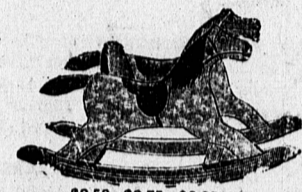
$2.50, $2.75, $3.25