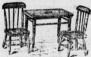
$1.75 to $5.50