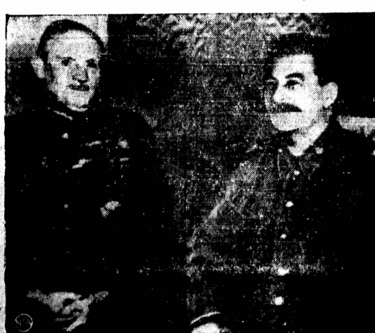
Generalissimo Stalin entertains Field Marshal Bernard Montgomery, Chief of the British Imperial General Staff at the Kremlin during Montgomery's Moscow visit.