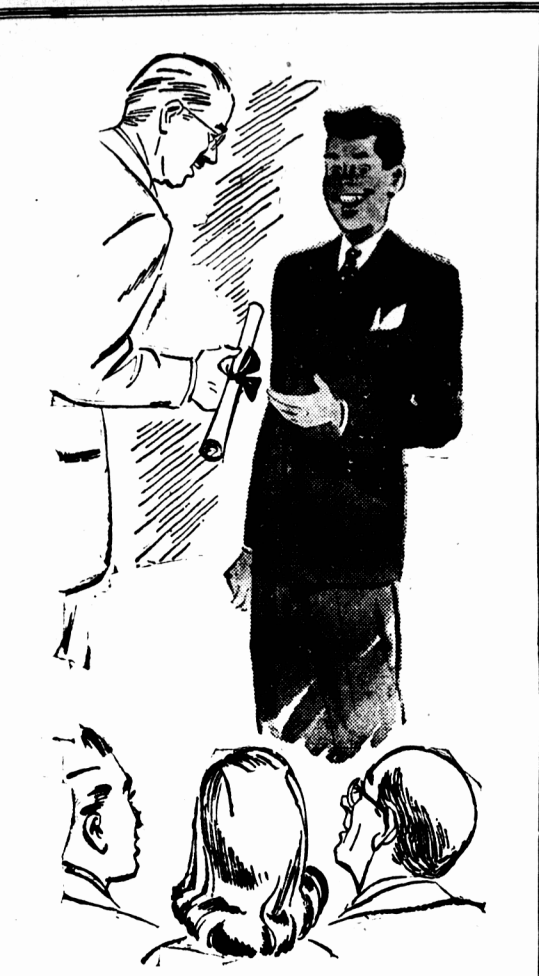
He's man of the hour, and he's smart enough to dress the part.