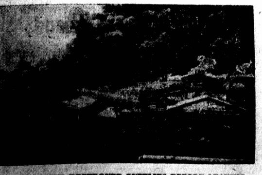
CANADIANS DESTROYED SUPPLIES BEFORE LEAVING

Thanks was expressed from Norway for the use of bases on Spitzbergen, one of the most northerly spots of land in the world. Russia operated out of the bases there before the war. In 1941 Canadian troops blew up the coal mines which had been occupied by Germany.