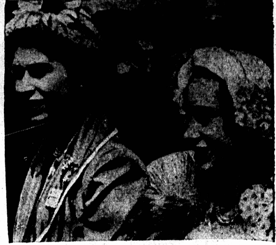
Recent opening of the Royal Ascot race meet at London, brought forth its customary galaxy of beauty, fashion and royalty. The attractive hats worn by England's Princess Elizabeth (left) and Margaret received as much attention as the horses. The King and Queen and Elizabeth's husband, the Duke of Edinburgh, also attended the opening day races.