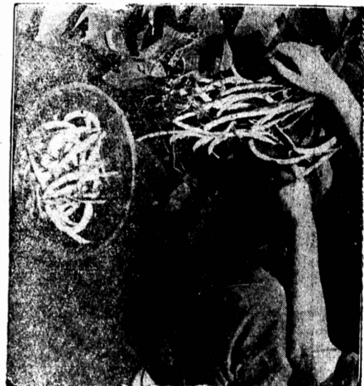
Wax Beans are Considered by Many to be Tenderest of All.