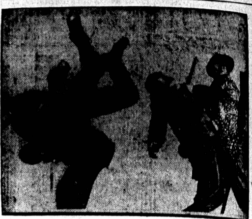
The fabled exploits of the world's toughest fighting men are dramatically revealed in this scene from Columbia "Commandos Strike at Dawn," which stars Paul Muni as the Prince Edward Theatre. Hundreds of real-life Commandos appear in the film's thrilling invasion sequence.