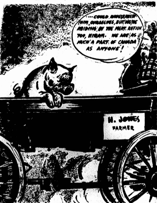
Cartoon courtesy Redford, Montreal Star.