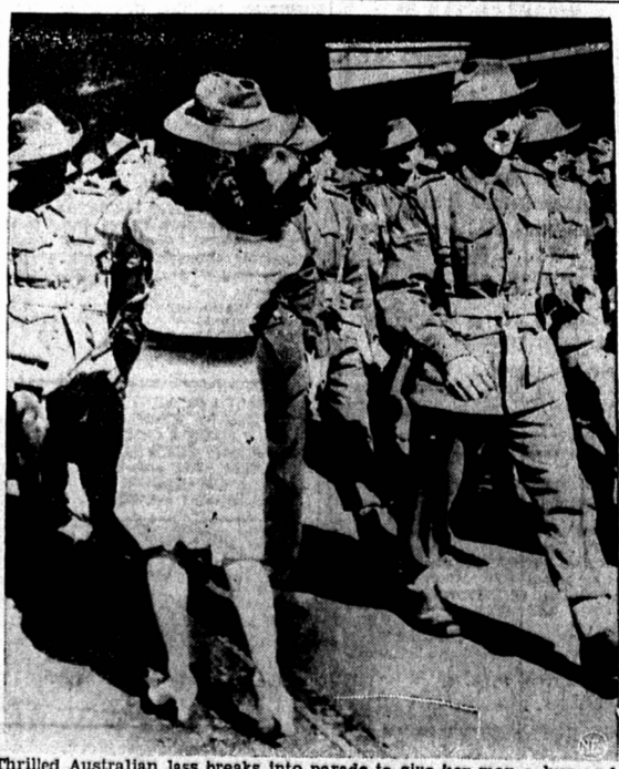
Thrilled Australian lass arrives in parade to give her man a hug and a kiss as Aussie division breaks into Melbourne from the Middle East.