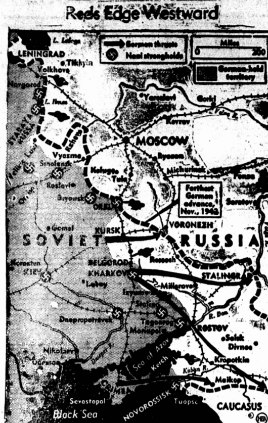
Map shows how Nazis fared in push of May-November, 1942, also where they stand today, pushed back and fighting desperately along battle line ranging from Leningrad to the Caucasus. Red armies continue to strike westward in punishing attacks all along front.