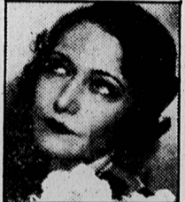
DOROTHY SEBASTIAN (M. G. M.) "Soothing and refreshing!"

And now the European stars are using this fragrant white soap! You, too, will want to try it. Order several cakes—today.