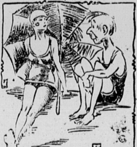
"Your thoughts are my thoughts." "That proves it! I've always said you never had any of your own!"