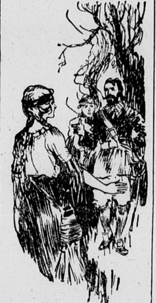
The Girl Now Shyly Advanced, and Extended a Hand to Narbonne. Saying, "I Have the Brave Frenchman to Thank Again."

"We go down the river to find the city of Acadia, where the diamonds grow on rose bushes, and the trees are almost as tall as Mademoiselle's grand old man."