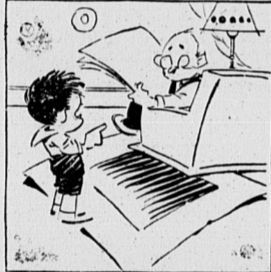
"Say, Pa, what do you call a person that reads heads?" "A phrenologist, my boy." "See, then Ma must be one of those things. She felt of my head this afternoon and said, 'Pa, you've been swimming.'"

All summer the lover has been on the rack. And he is not happy precisely to find that the girl he's engaged to has a wonderful gift to kiss nicely.