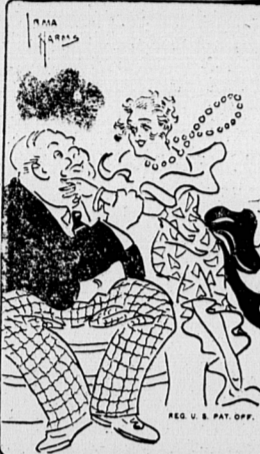
"Girls may love nice, old things, but they wear nice, new ones."