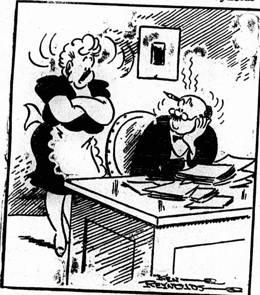
"How many more payments, dear, before we can sell the house with a Guardian Want Ad?"