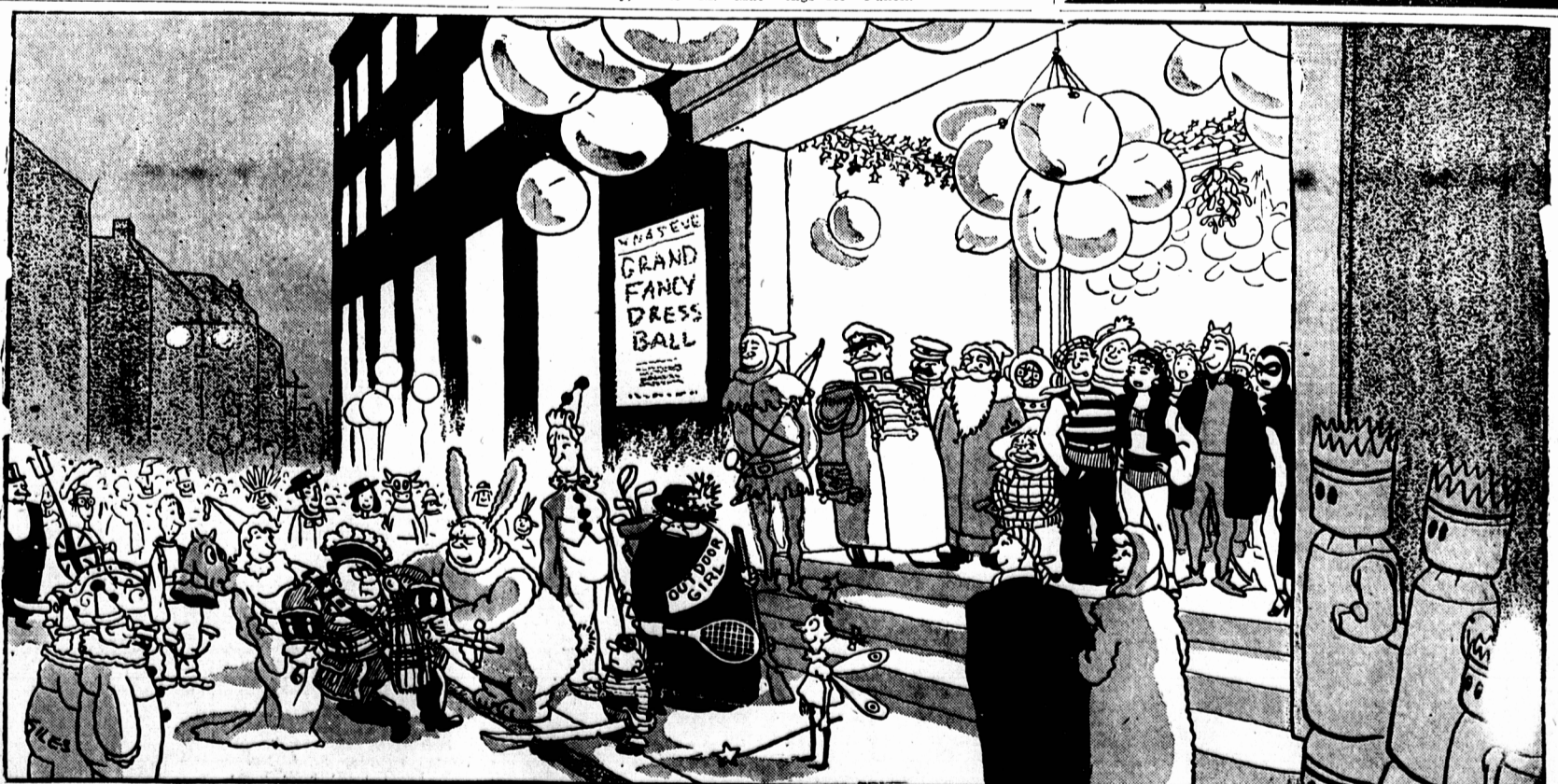
"Don't be silly, father—there'll be ever so many dressed as Bonnie Prince Charlie this year."