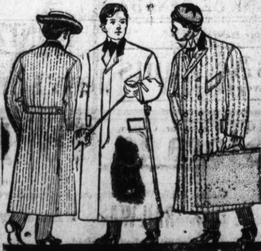
Buy the Boy an Overcoat