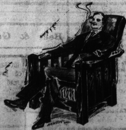
Give Him a Smoker.

We especially invite Ladies to buy gifts for him here where stocks are largest and best. Give him a FUR COAT, pair of Mitts, Gloves or Hatery in cashmere and wool 25 to 50c. Underclothing, flannel lined $1.00 suit to 1.75. Wool underclothing $1.20 suit to 5.00. Shirts for working men 50c to $2.10, in all different colors and patterns. Grey flannel $1.15 to 1.85. Blue flannel $1.15 to 1.85. Blue serge $1.35 to 2.10. Fancy shirts 75c to $1.25. Hard bosoms colored 75c to $1.25. White shirts 60c to 1.85. White linen collars in all different heights and styles 15c each 2 for 25c. Also better grades at 20c each. Celluloid collars 14c to 25c.