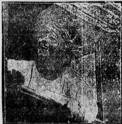
The oldest engineer on the Santa Fe Railroad was an admirer of Edna Wallace Hopper, 40 years ago. He has invited her for a ride in his engine for old time's sake.