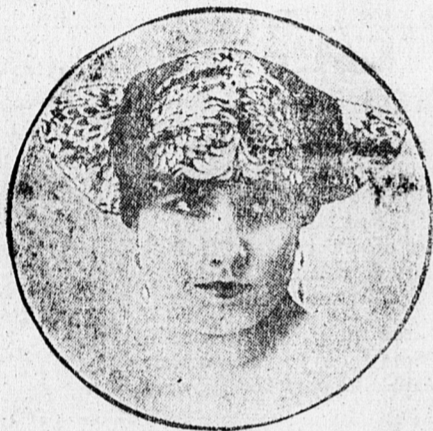
Here's a chic little hat for fall wear that has just arrived from Paris. Black satin and metallic brocade are the materials.