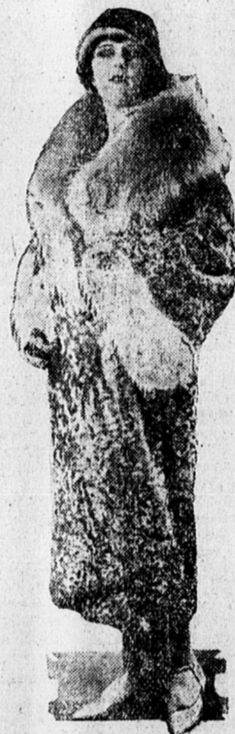
This delightful motoring coat is made of cocoa caracul with sand colored fox collar and cuffs.