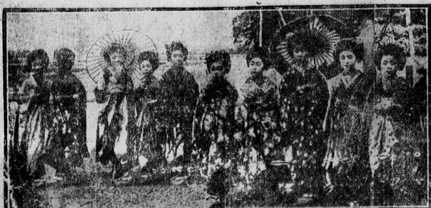
Ten little geisha girls lined up for morning exercise in Yokohama before the dawn.