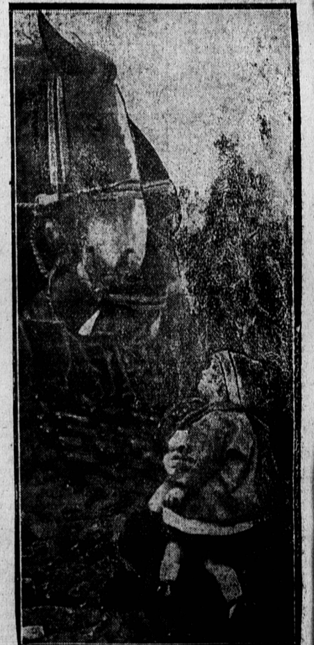
A youthful connoisseur of horses looking down the lines at the annual Yorkshire futon.