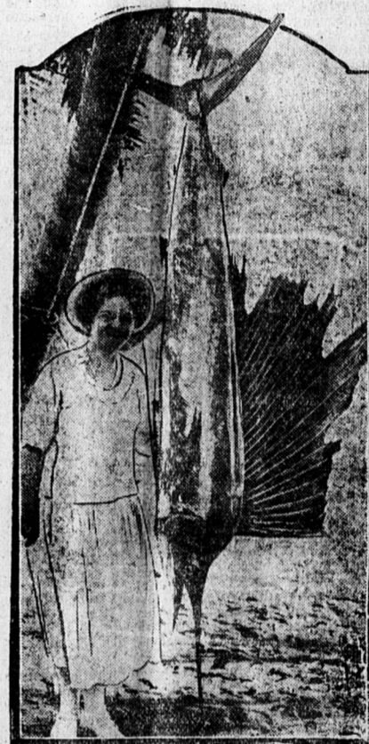
Capable of swimming at a rate of 70 miles an hour, the sail fish is the speediest member of the whole finny tribe. This eight-foot monster was landed at Long Key, Fla.