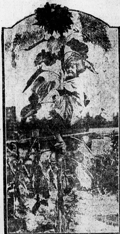
A modern version of "Jack and the Beanstalk," except that this one happens to be a sunflower. It is 103 inches tall and still growing.