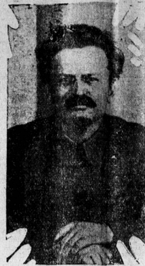
Leon Trotsky, Russian Soviet war minister, is again reported assassinated. He seems to possess the proverbial nine lives of the cat.