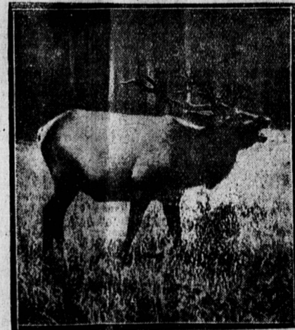
A remarkably fine specimen of Vancouver Island elk, calling its mate from the underbrush.