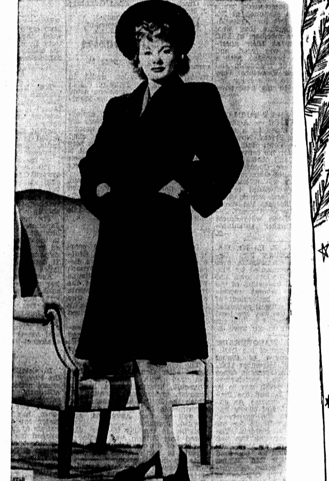
LUCILLE BALL, R. K. O. Radio Picture Star

Just 3 Left of Perfect Persians Beautiful Black Persian Lamb, close curled lustrous fur, every one a fashion success, designed and tailored by artist furriers, coats that mean practically a lifetime investment. Sizes 16 and 18 only. $379.00, $395.00, $450.00