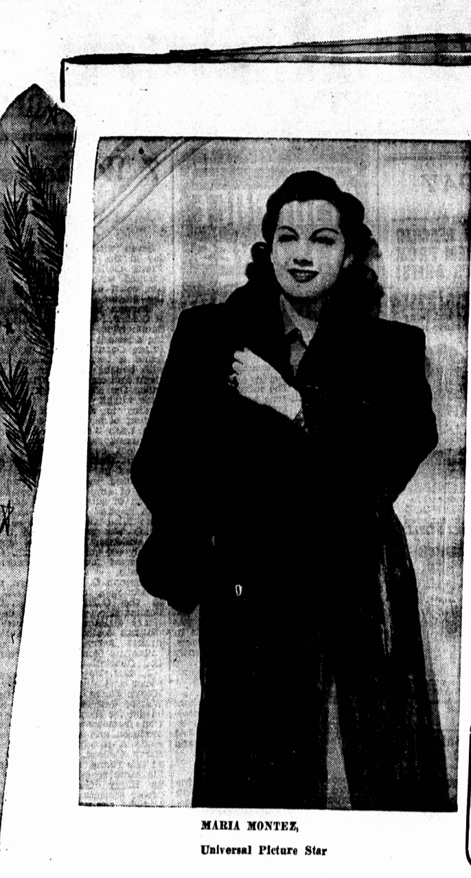
MARIA MONTEZ, Universal Picture Star

IN JAPS' OWN GAME HONOLULU — (CP) — Picked sun-browned leathernecks — U.S. Marines — are attending organized classes here to learn ju-jitsu and fight Japanese when the occasion arises. It, with their bare hands and "for keeps."