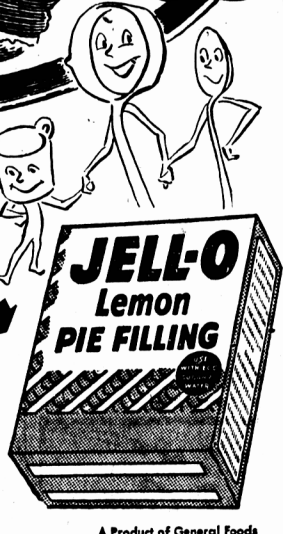
A Product of General Foods

Jell-O is a trade-mark owned by General Foods, Limited